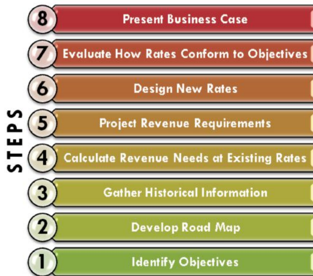
Figure 1. Cost of solid waste service planning steps

The division has developed a routine replacement program for critical operating equipment—compactors, dozers, earthmovers, and excavators—through the capital improvements plan. This helps ensure reliability of new and reliable equipment is available and also helps keep downtime and repair costs to a minimum.